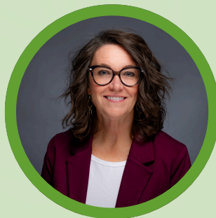
SUPERINTENDENT LISA ROBERTS SPRING 2025

As we look to the future, we are setting ambitious yet achievable goals to integrate smart resource use and more cost-effective practices into all aspects of district operations, curriculum, and culture. This roadmap outlines strategic priorities and measurable outcomes that will guide BSD toward achieving a more resilient, thriving future for all students and staff.